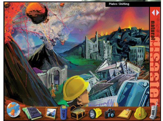
The Discovery Screens are packed with illustrations and information about exciting earth science projects.