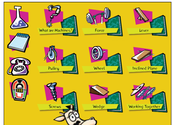
Students select nine different topics in the content area.