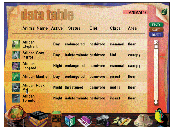
In the Data Table , students sort and classify information on animals and plants of the rainforest.